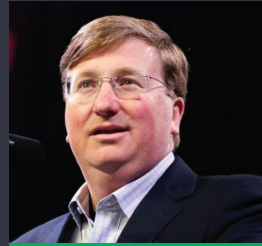
Governor Tate Reeves

As an NFIB member, you are part of an organization that works to defend your right to own, operate and grow your business, by expanding your voice in Congress and state legislatures across the nation. This communication is an exclusive benefit of your NFIB membership. It has been paid for by NFIB member donations outside of your membership dues and is authorized by the National Federation of Independent Business, NFIB.com.