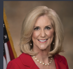
Attorney General Lynn Fitch